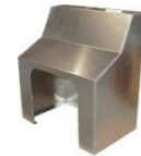
commercial console with bend

"Many More Parts and Accessories Available"